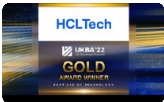
Gold – Best Use of Technology