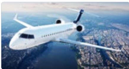
Large Transport, Business, Regional