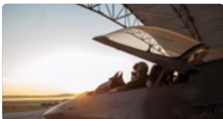
Air & Space