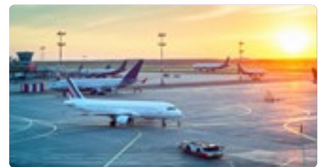
Airports & Airlines