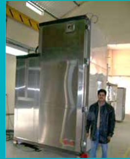
Climatic Chamber (large) ESS Chamber

HCL can test to global standards and help customers with certification, including FCC and CE certification.