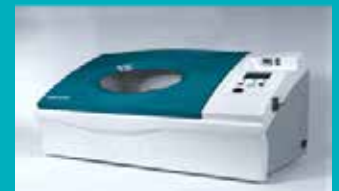
Acoustic Noise Testing