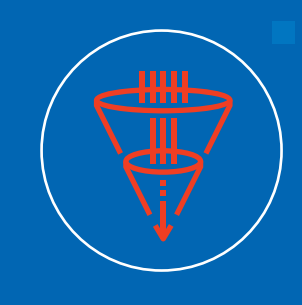
SOC 2 Assessment and Audit