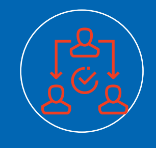
Enterprise Architecture (EA), SOA