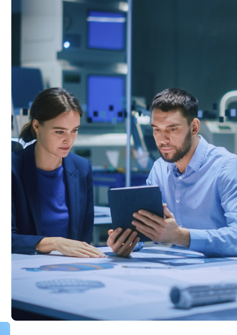
Supercharge business outcomes with SAP BTP