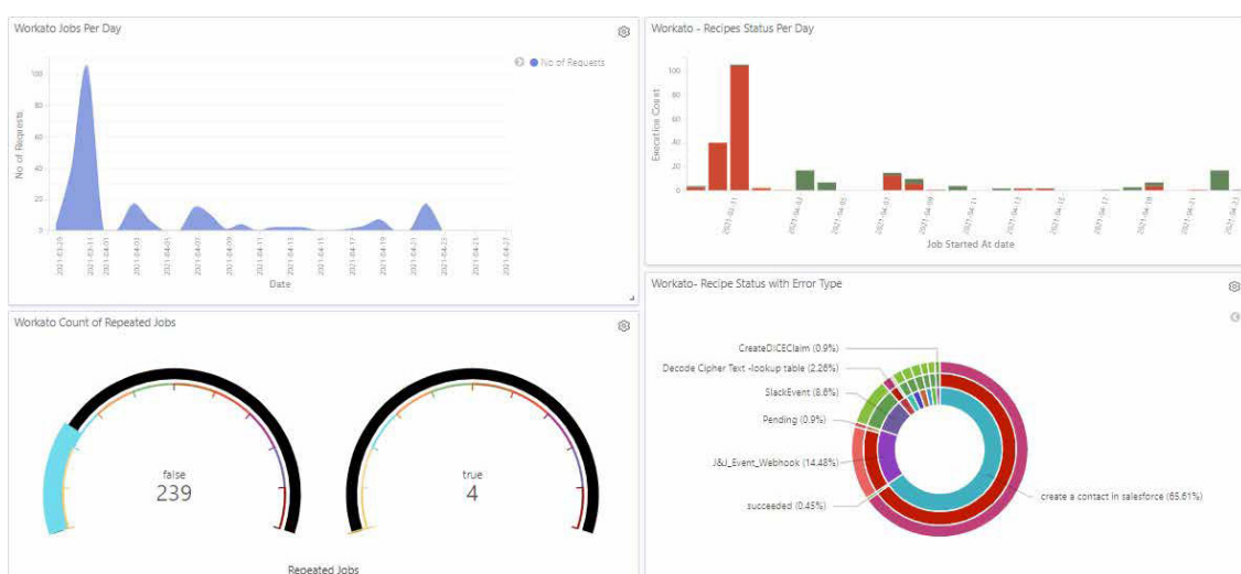
ROAR™ dashboards depicting recipe execution summary counts for various scenarios including repeated jobs

framework provides an ELK-based, real-time view (operational as well as business) summarized by service, operation, partner etc. churning out visuals and dashboards. It is built on next-gen UI frameworks and enabled with a role-based access module, custom developed by HCLTech.